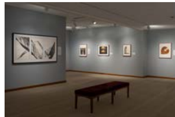
Modern Abstractions installation view