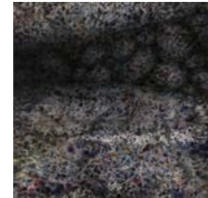
Right: Sunghyun (Peter) Moon Afternoon , 2015 watercolor on paper Joy Light East Asian Art Acquisition and Exhibition Fund, 2019.6