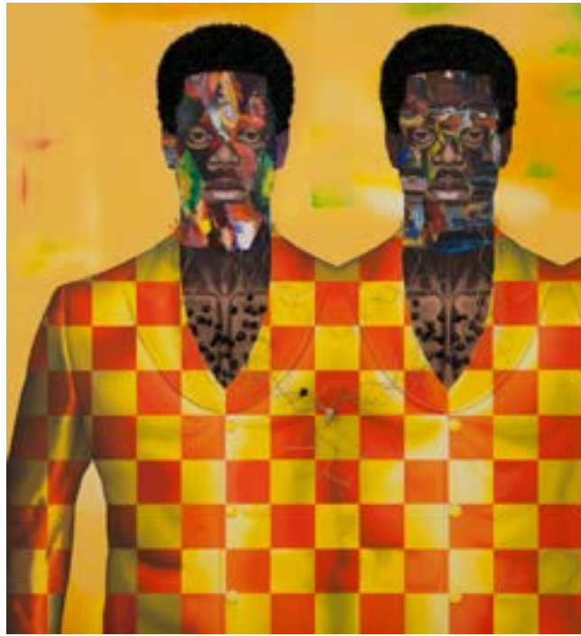
Jeff Sonhouse Conceived in a Seamstress' Garden , 2020 acrylic, collage, metal wire on canvas David and Muriel Gregg Fund Purchase, 2020.39 © Jeff Sonhouse