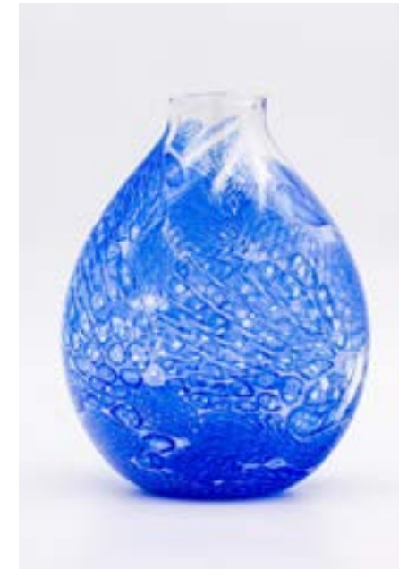
Left: Young Artists of Kalamazoo County 2020 installation