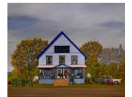
Craig Bishop Saturday Morning Haircuts oil on linen