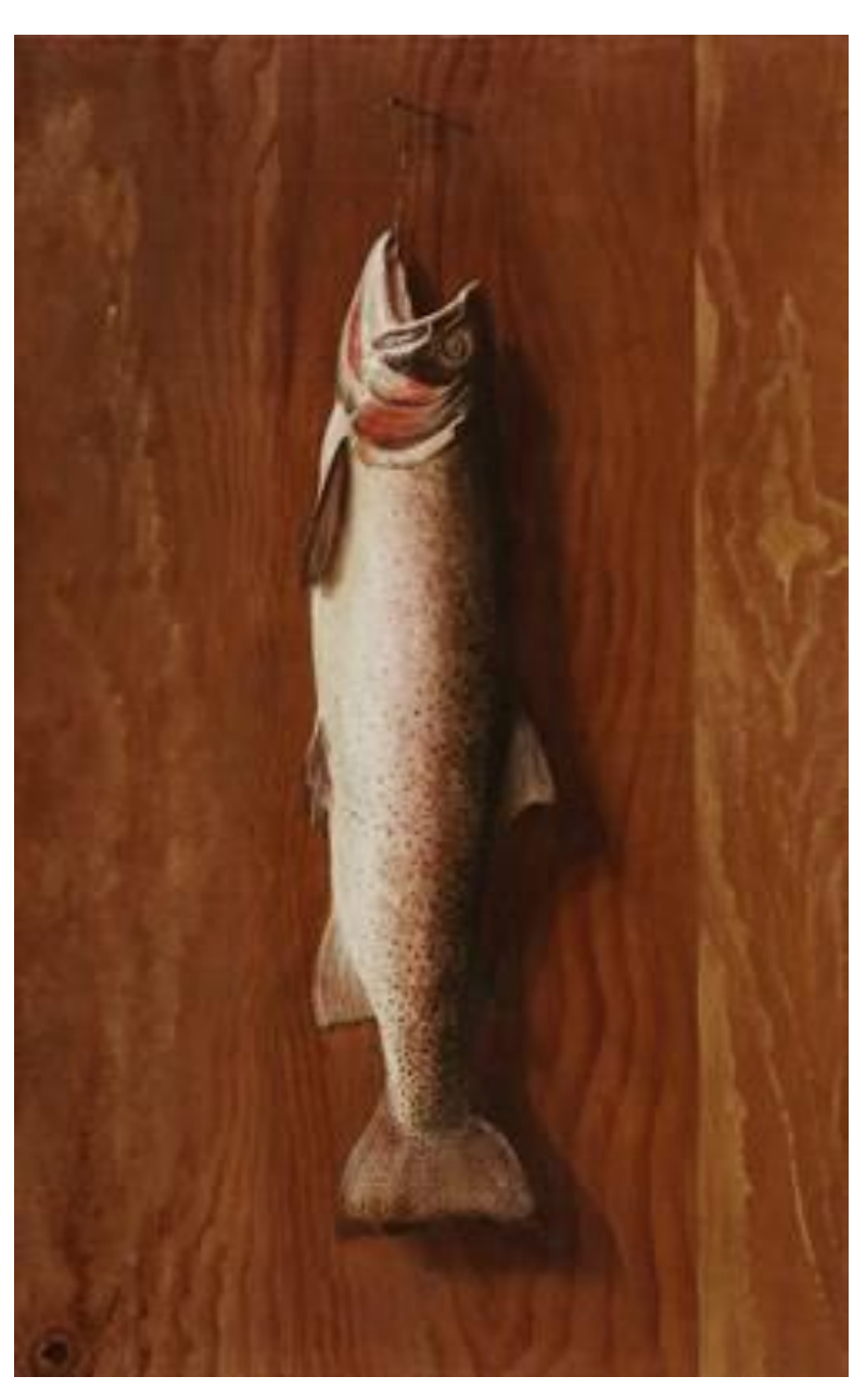
Grafton Tyler Brown. Trout, 1886 Oil on Canvas, KIA Collection

Cn11.1.4a: Through observation, infer information about time, place, and culture in which a work of art was created.