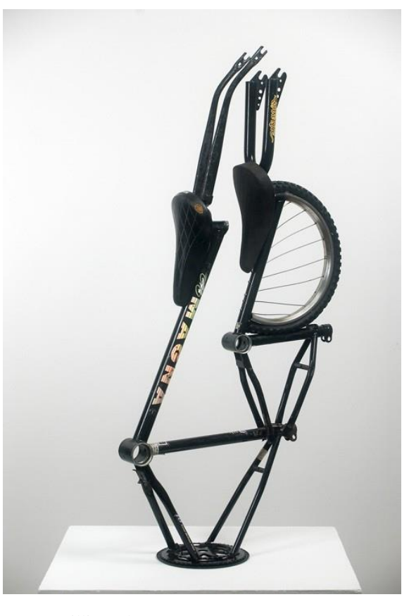
Willie Cole Magna Tji Wara , 2006 Bicycle Parts, Flint Institute of Arts

Cole's Tji Wara pieces take inspiration from both the African tribal myth and the global unity of bicycles. Bicycles are elegant and speedy in races like the Tour de France, but for many of the world's citizens, they are also one of the most practical means of transport.