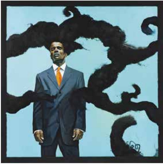
Kehinde Wiley, Conspicuous Fraud Series #1 (Eminence) , 2001, oil on canvas. The Studio Museum in Harlem; Museum Purchase made possible by a gift from Anne Ehrenkranz