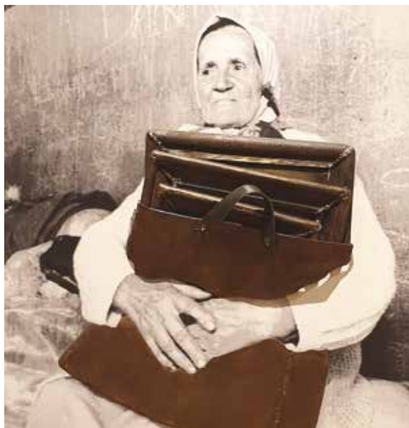
Orna Ben-Ami, Memories , 2016, welded iron on photo. Original photo: REUTERS / Corinne Dufka