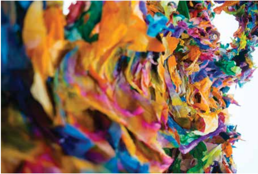
Maya Freelon, Wavelengths , 2018. Site-specific tissue quilt installation. Private collection, courtesy of the artist