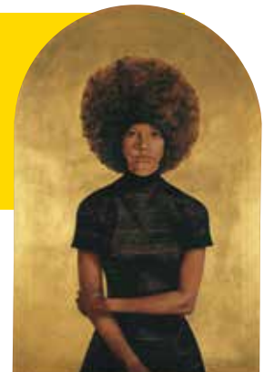
Barkley L. Hendricks, Lawdy Mama, 1969, oil and gold leaf on canvas. The Studio Museum in Harlem.