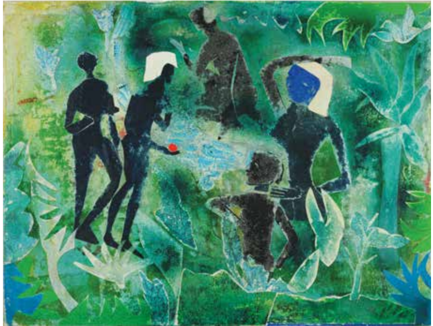
Above: Romare Bearden, The Blue Pool , 1973, acrylic and collage on board. Collection of the Kalamazoo Institute of Arts. Elisabeth Claire Lahti Fund purchase