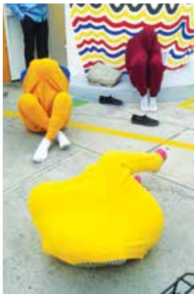
Sol LeWitt and Erwin Wurm do it instruction at NuMu in Guatemala City in 2015.

This exhibition is organized by the Virginia Museum of Contemporary Art. With lead support from the Capital Group Companies Charitable Foundation. Generous grants were provided by the City of Virginia Beach Arts and Humanities Commission, the Virginia Commission for the Arts, and the Business Consortium for Arts Support.