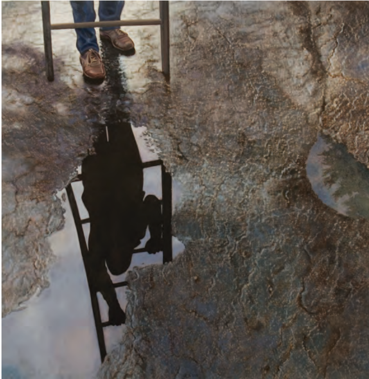
Joel Sheesley, Messenger , 2008, oil on canvas. Shown in Poetry of Content: Five Contemporary Representational Artists . Courtesy of the artist