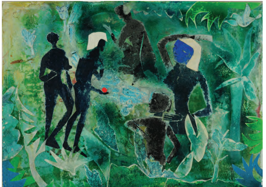
Romare Bearden, The Blue Pool , 1973, acrylic and collage on board. Collection of the Kalamazoo Institute of Arts. Elisabeth Claire Lahti Fund purchase