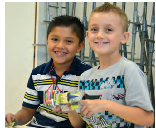
Clockwise from top: