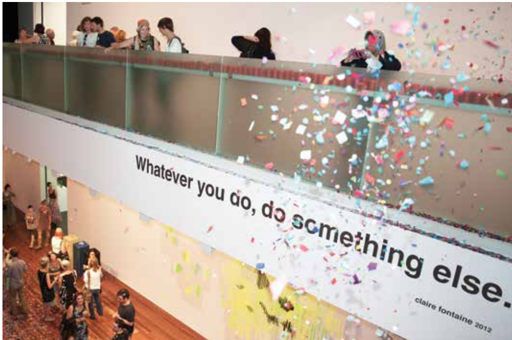
do it at Anne & Gordon Samstag Museum of Art, 2015.