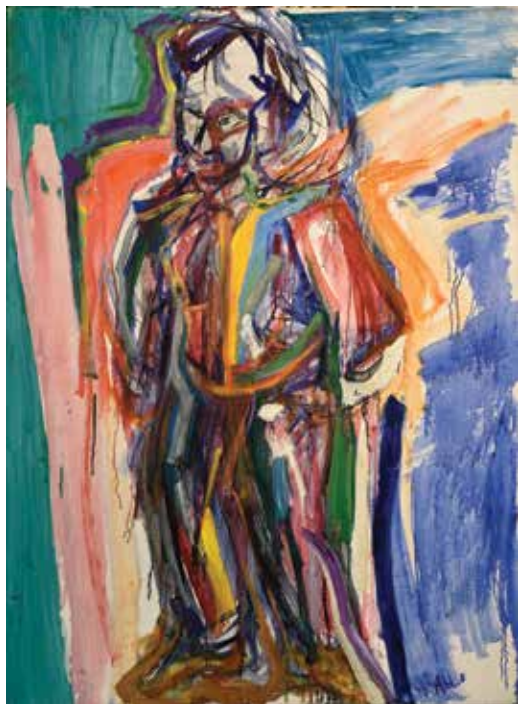
Mary Abbott, Untitled , oil on canvas.

Abstract Expressionism, developed in New York in the 1940s, was the first American movement to achieve international influence and put New York City at the center of the western art world. In an almost immediate reaction, a group of painters began reintroducing the figure into this high-energy postwar movement. The Expressionist Figure examines some of the leading artists of the time, including important women painters. The exhibition includes Bay Area notables like Deborah Remington (who co-founded the legendary Six Gallery in San Francisco) and the leading feminist painter of the late 20th century, Nancy Spero. During a self-imposed exile to Paris, Spero completed the important series the Black Paintings , and established herself as one of the important social and political artists of her time.