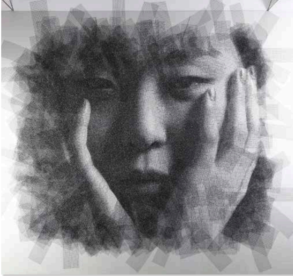
Seungmo Park, Maya 1316 , 2012, stainless steel wire mesh