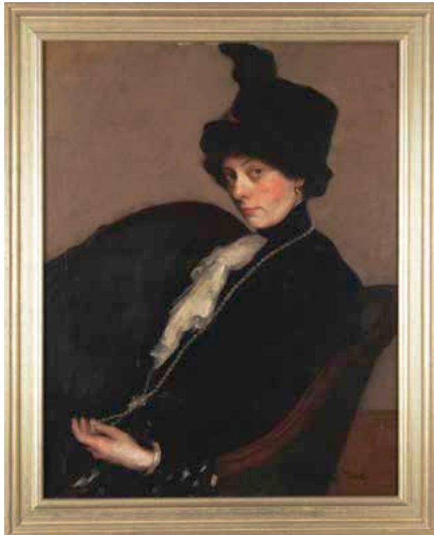
Nina Belle Ward, Portrait of a Lady in Black , ca. 1912. Collection of the Kalamazoo Institute of Arts; Gift of A. Pitzer Ward